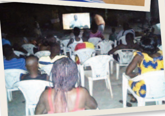
Above: Motorcycle ride to villages. Below: Jesus Film showing